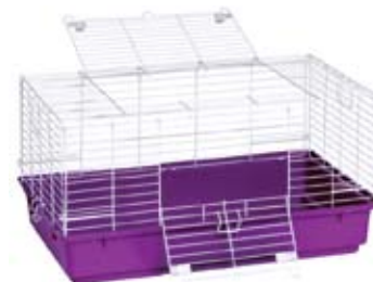
Plastic Bottom Rabbit Cages