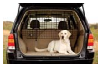
Wire Pet Barriers