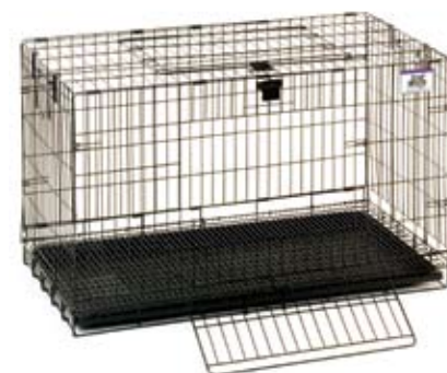
Pop-Up Rabbit Cages