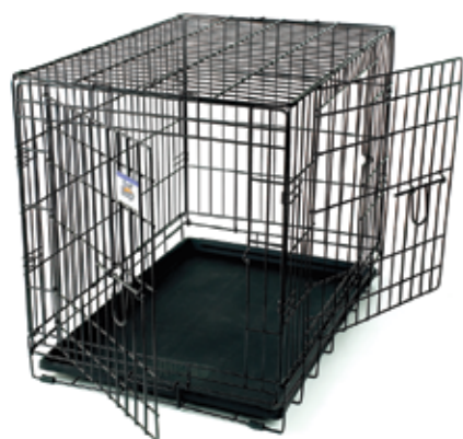
Double Door Wire Crates