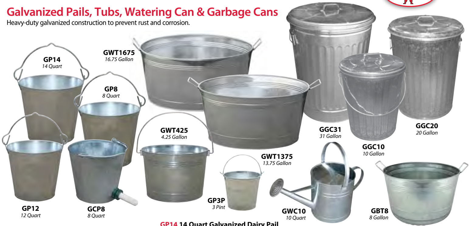
GP14 14 Quart

Heavy-duty galvanized construction to prevent rust and corrosion.