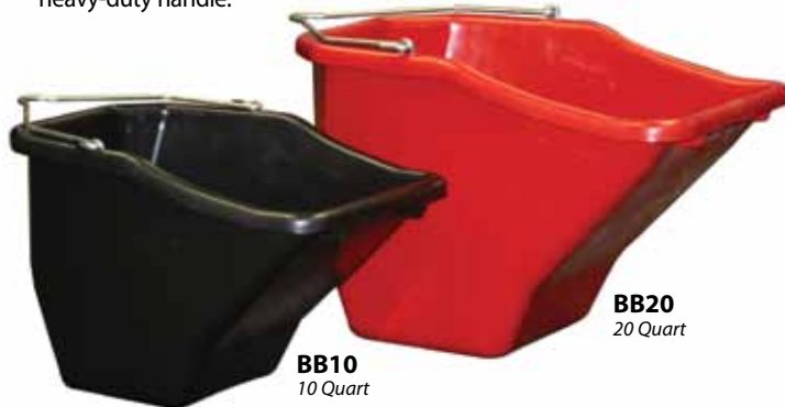
BB10 10 Quart

Flat back provides stability against a wall or fence. Fits on a flat wall with either a traditional wall bracket or snap hook. Durable, impact resistant, high-density polyethylene construction with smooth finished edges and heavy-duty handle.