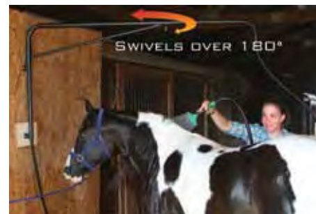
SWIVELS OVER 180°