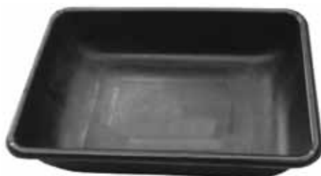
PT20BLACK 20 Gallon

L 35.5" x W 24" x H 7.25" Made of tough, impact resistant, high-density polyethylene which protects against warpage, stress cracks and UV damage. Rounded lip for added durability. Great for washing auto parts and mixing concrete.