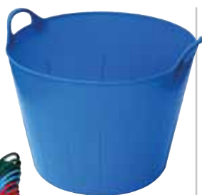
FT11 11 Gallon

L 19.25" x W 17.5" x H 14.5" Available in blue, green, hotpink, limegreen, purple and red.