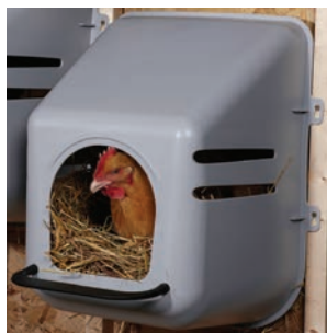
Covered plastic nesting box also available.